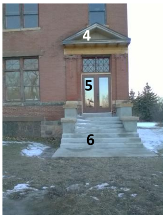
Restoration of front entry is nearing completion