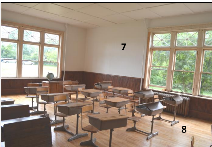
The restored west classroom of Manfred School