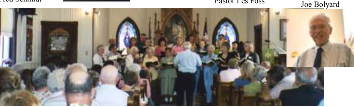
The sounds of the choir were thrilling for both participants and congregation alike to experience