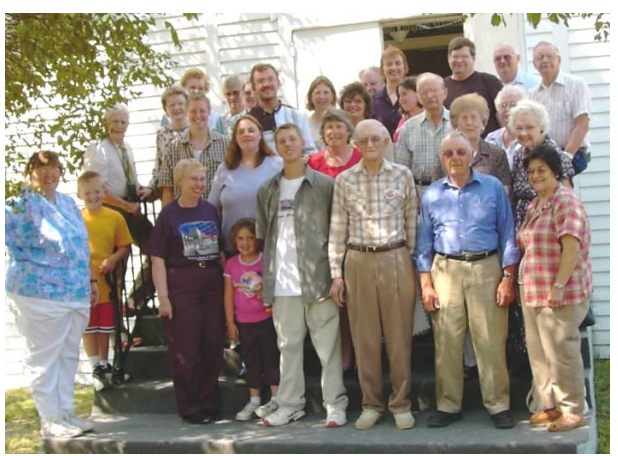
Gathered for Annual Meeting July 25, 2004