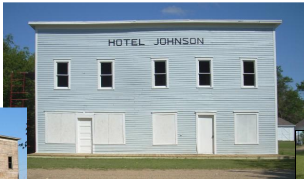
Hotel Johnson/Fagerlund Sons of Norway Hall