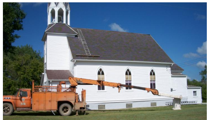
Vang Lutheran Church